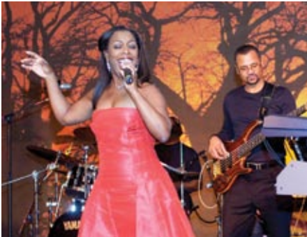
Oleta Adams entertains guests

Held in New York City on October 27, AAF's A Celebration of Partnership Gala raised over $600,000 to support the programs at the Infectious Diseases Institute (IDI). This mile-stone